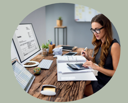
DESIGNATED DESK MEMBERSHIP