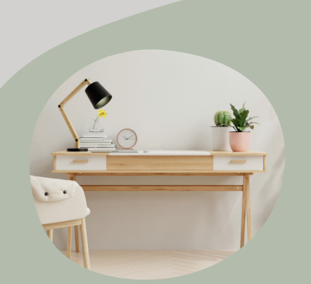
SHARED OFFICE SPACE MEMBERSHIP

Unlimited on-premises Wifi, Strategy Sessions, Courses, Workshops, Masterminds and more!